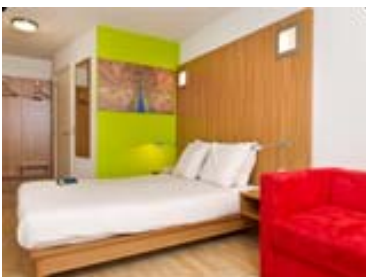
Ibis Styles Antwerp City Center

Koningin Astridlaan 43, 2018 Antwerpen (close to central railway station and 1500m from our Conference Centre)