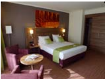
Mercure Antwerpen Centrum Opera

Molenbergstraat 9, 2000 Antwerpen (close to central railway station and 1300m from our Conference Centre)